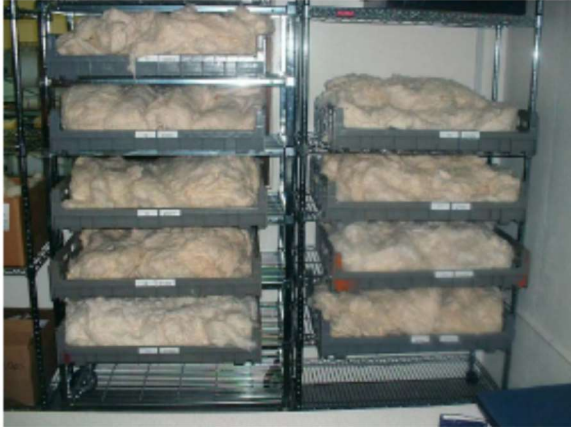
Figures: Storage of samples for conditioning [Uster]

(Recommendations) It is important to undertake regular checks of the moisture content of the cotton samples. For Upland cottons, the moisture content should not exceed the range of 6.75 to 8.25% (dry basis) and should not vary by more than 1 percentage point from that of the Calibration Cottons. Out of range samples should be allowed additional conditioning time. If the range is still not achieved, then the sample should be marked as exceptional.