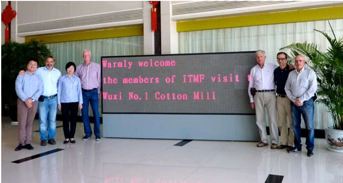
Visit of Wuxi No. 1 Cotton Mill

It has a total of 600'000 ring spindles, all compact with some SIRO, which, as regards the raw material, consume 1/3 synthetics (PES, CV, Modal, Tencel) for blends, 1/3 ELS cotton and 1/3 for upland cotton.