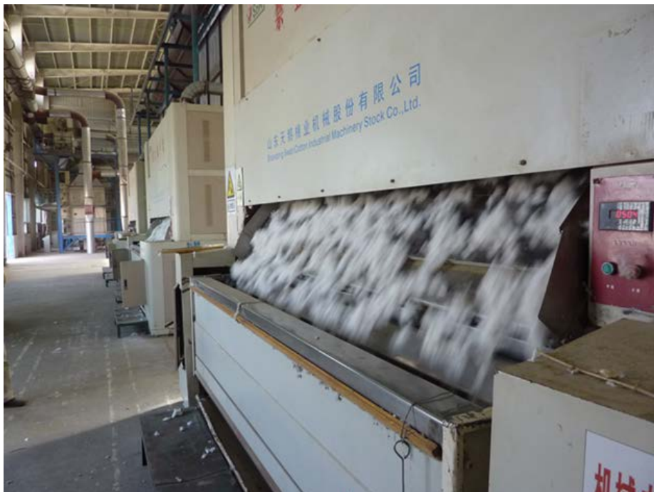
XPCC's saw ginning mill in Akesu (Xinjiang)

The Committee visited a saw gin where upland cotton is ginned. The gin was very clean and well organised with concrete patios. The seed cotton was piled according to the source of production.