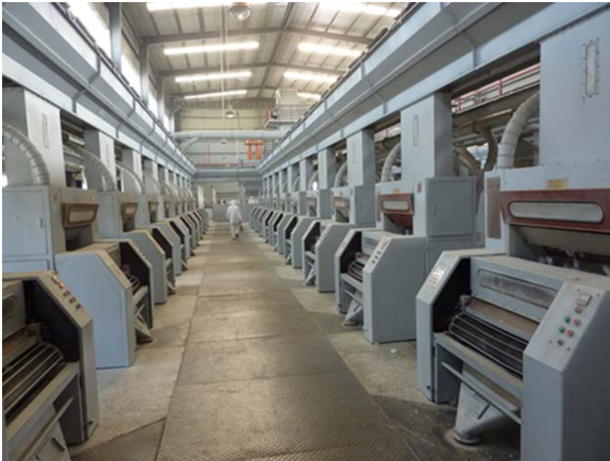
Esquel's roller ginning mill in Akesu (Xinjiang)

The Committee recognised a well-organised roller gin set-up (punch blade ginning) ginning extra-long-staple cotton with a clear evidence of excellent housekeeping. The cotton is ginned with a unique in-house developed roller-punching system.