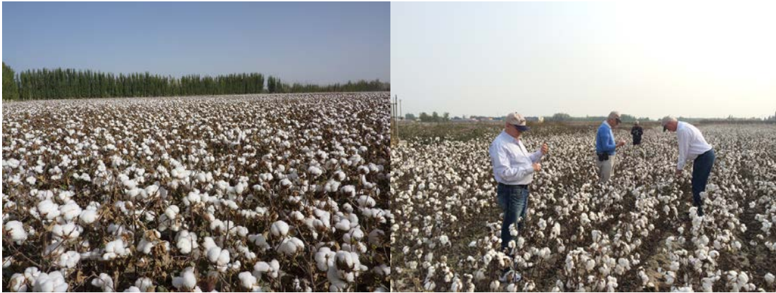
Cotton fields in Xinjiang (left) and in the East (right)

The farming practices and quality observed in the different regions differ quite significantly. While in Xinjiang the fields seemed to be in a very good state, especially those of the large coops, the situation was different in the smaller fields. Some were excellent, others in poorer conditions.