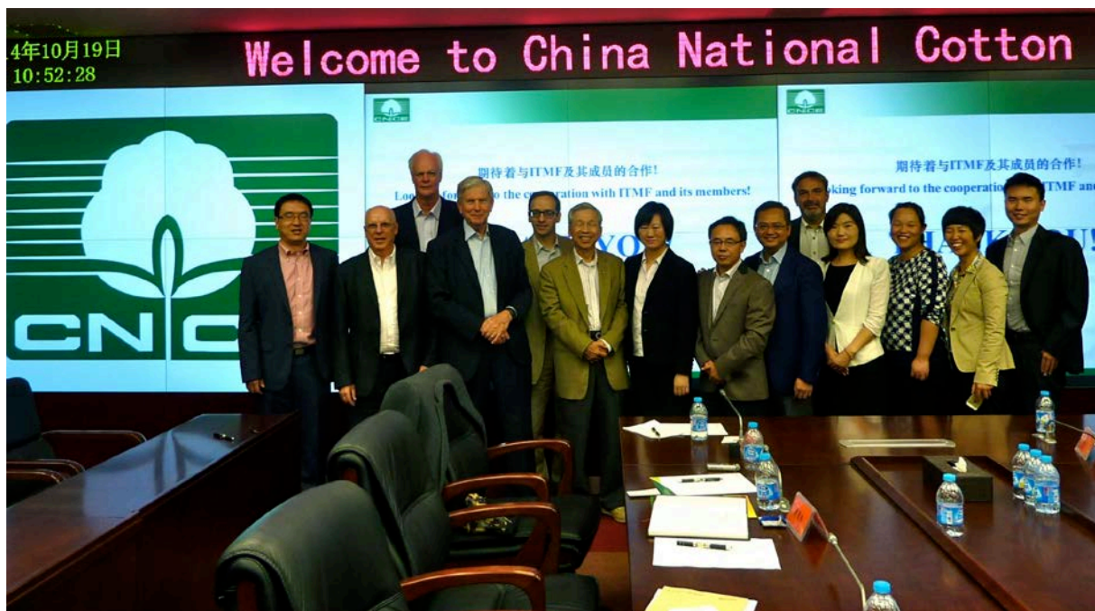
Visit of the China National Cotton Exchange (CNCE) in Beijing.

The Committee visited CNCE, the neutral trading platform for spot cotton in China. CNCE informed the Committee about their various other services ( www.cottonchina.org ) and its role in the new cotton policy. The Committee was shown a live demonstration of the warehouses monitoring system, showing that from the headquarters in Beijing it is possible to monitor the warehouses all around the country.