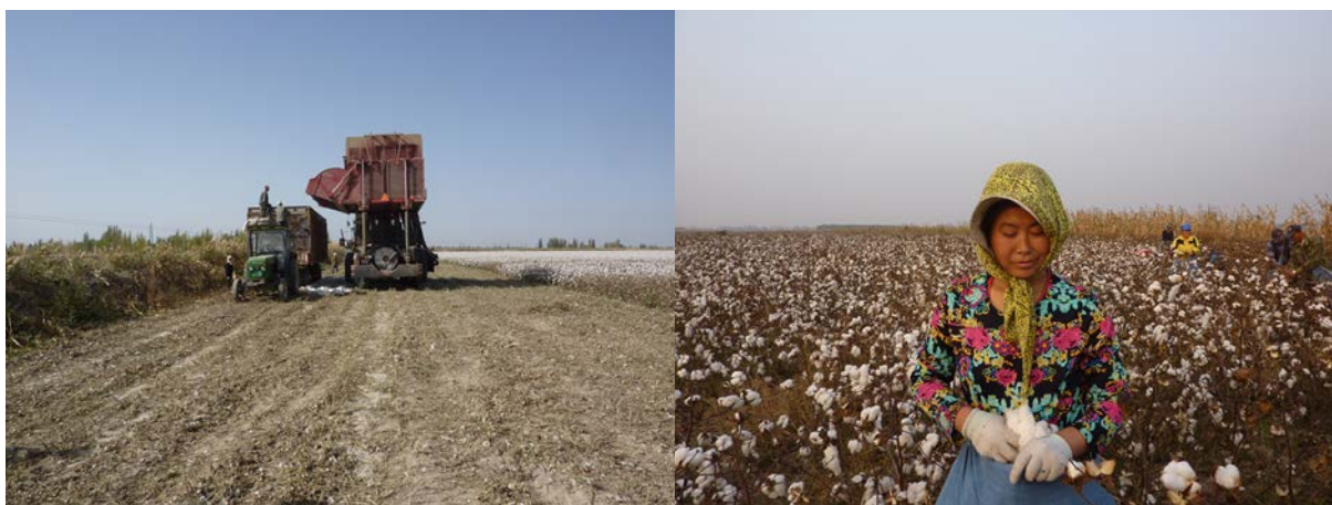
Machine picking in Xinjiang (left) and hand picking in the river deltas of the East (right).

When looking at cotton picking in China one has to differentiate between the cotton growing areas in the West (Xinjiang) and the East (river deltas). In Xinjiang the share of machine-picked cotton has increased significantly to approx. 60-70% due to the high labour costs. The vast majority of cotton production in Xinjiang is taking place on larger areas that allow for mechanical harvesting, but this is not the case in the East. In the Eastern Provinces most farms are smallholder farmers with an average size of around 0.3 hectare.