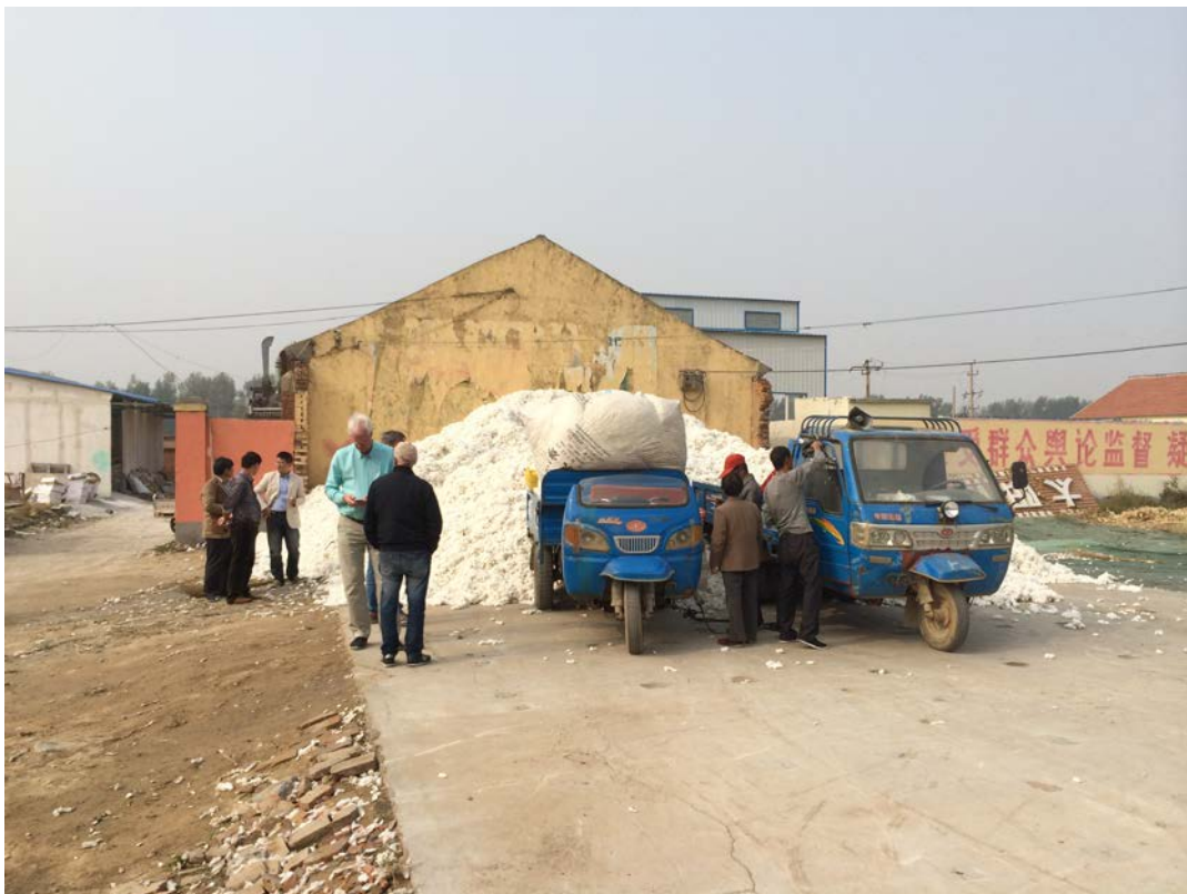
Smallholder farmers selling their seed cotton to a middleman.

The cotton price for a farmer that was being delivered to an agent was RMB 6'700 – 6'800 /ton (hand-picked). The farmer could not afford to transport the small quantity he had to the ginner. Therefore, "agents" or middlemen act as whole-traders.