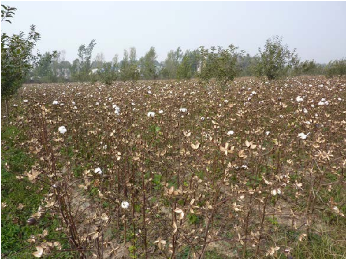
Cotton field in Hebei Province

In this area the farmers also cut off the top of the cotton plants but irrigate by flooding the fields once before planting.