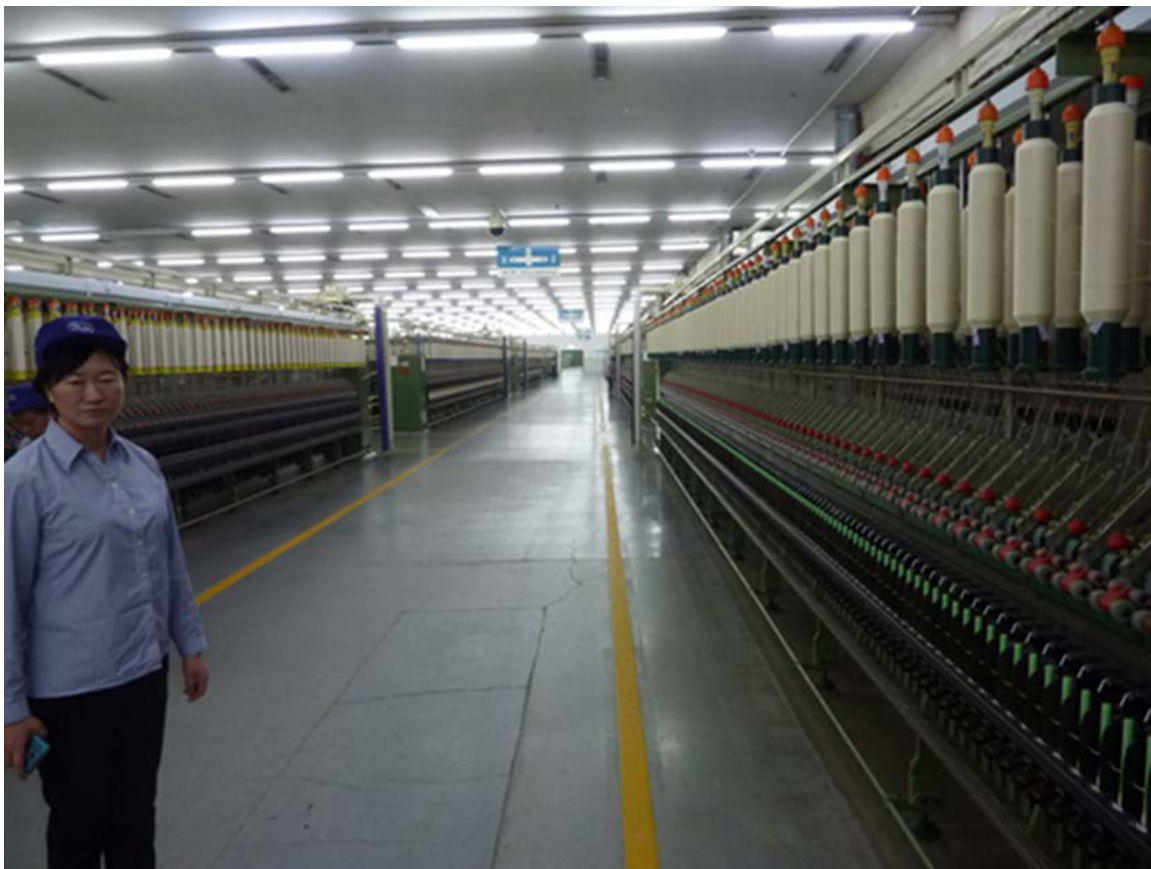
Inside of Wuxi No. 1 Cotton Mill

Their yearly cotton consumption is up to 30'000 tons from Xinjiang, USA, Australia and W. Africa while synthetics fibers consumption is around 10'000 tons per year.