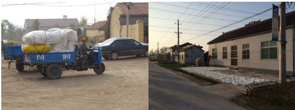
Small open truck (left) and cotton drying on patio (right).

In Xinjiang where the cotton is predominantly machine-picked the cotton is transported directly from the fields to the gins on open trucks. Smallholder farmers, who have hand-picked their cotton, transport it on smaller vehicles to middlemen, who then transport it on larger ones to the gins. In the more humid cotton growing regions in the East smallholding farmers often need to dry the cotton first on their patios or on the narrow public streets before they can sell it to the middlemen.