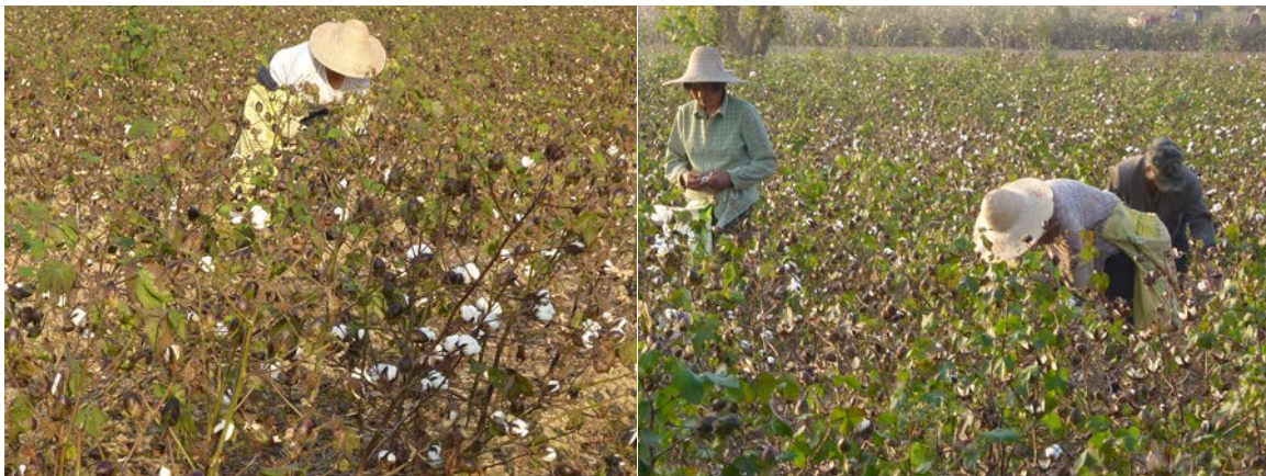
Handpicking cotton in the East of China.

There was no irrigation and there was space between plants being reserved for wheat. As in other areas the tops of the plants had been cut off.