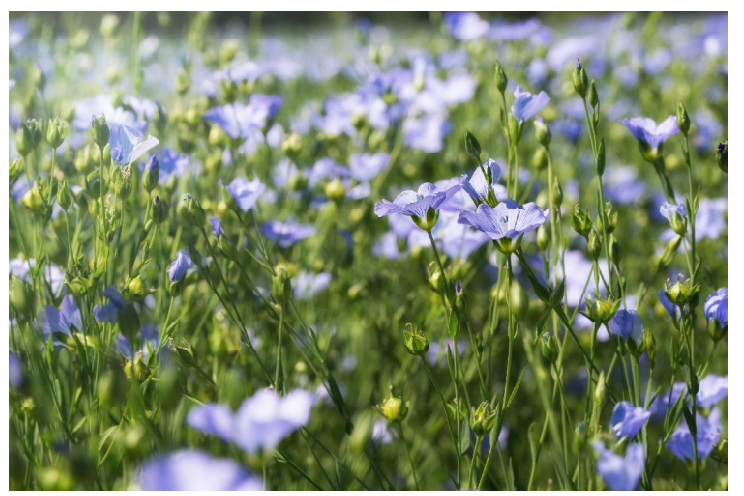
Fig. 1: Flowering flax field

With today's increasing environmental awareness, textiles the water requirement is low