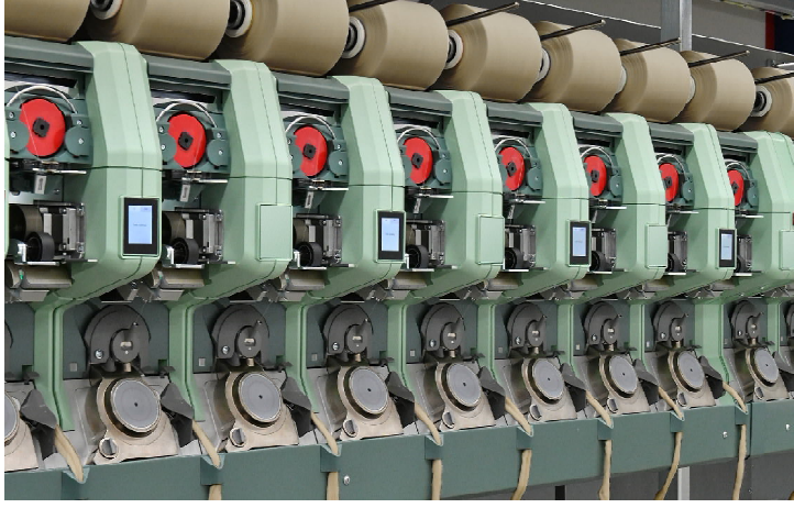
Fig. 4: Yarns of 100% flax or blends can be produced economically on a rotor spinning machine.

Yarns made of flax blends or of 100% flax are manufactured flax fibers using appropriate efficiently on the Rieter rotor spinning machines R 70 (fully carding elements. The focus is on automatic) (Fig. 4) or R 37 (semi-automated). These machines