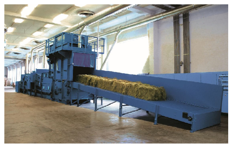
Fig. 2: Preparing the flax tow for the spinning mill on a Temafa machine

In this process, the fine cleaner UNIflex B 60 is responsible