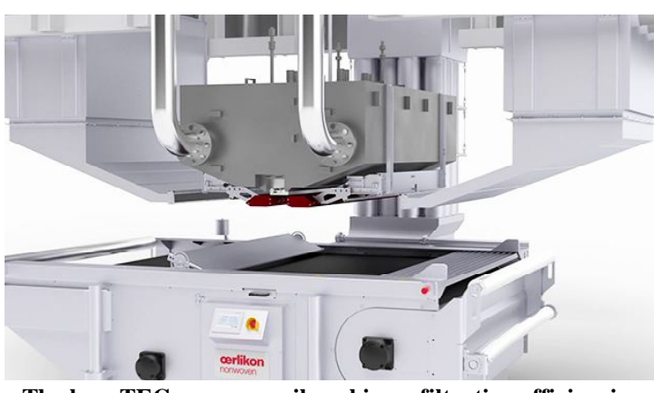
The hycuTEC process easily achieves filtration efficiencies in excess of 99.99% in the case of typical filter media

In the case of its hycuTEC hydro-charging solution, Oerlikon polyester is today used as well, depending on the application Neumag offers a new technology for charging nonwovens that requirements and cost-benefit considerations. Against this increases filter efficiency to more than 99.99%. For meltblown background, the Oerlikon Barmag technologies make an invaluable producers, this means material savings of 30% with significantly