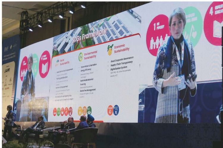
The scenes of ITMF/IAF Convention 2025 i Yogyakarta, Indonesia

Ungaran Sari Garment, gaining firsthand insights into the country's manufacturing excellence, innovation capacity, and commitment to sustainability.