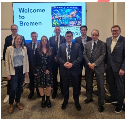
4. International Textile Seminar Bremen 24. March 2026, 14:00-17:00, Room 406 AI and Digitalisation - Opportunities for the Textile Industry