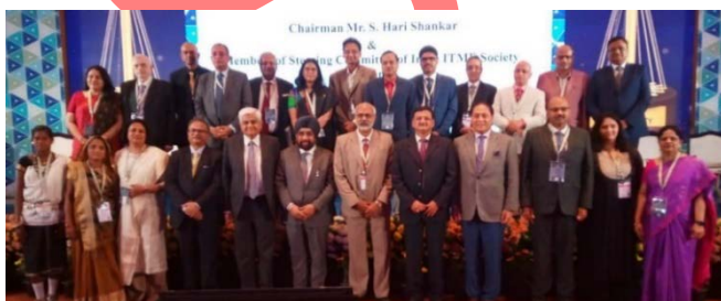
ITME 2022: opening ceremony

The 11 th edition of India ITME was held on December 8 th to 13 th 2022 in New Delhi. This textile engineering and technology event hosted more than 1600 exhibitors and welcomed 87'400 visitors from 68 countries over 6 days.